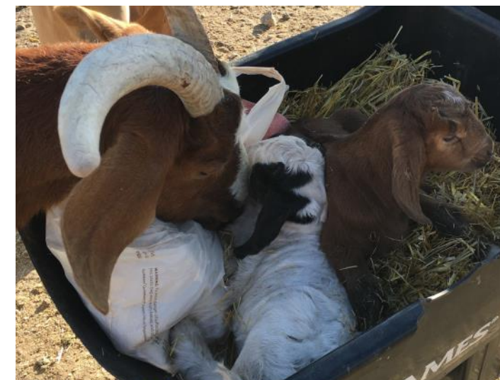
Easter babies Hal and Lou with Mama Fine