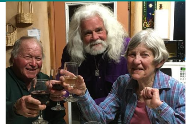
Celebrating our church family on Easter!