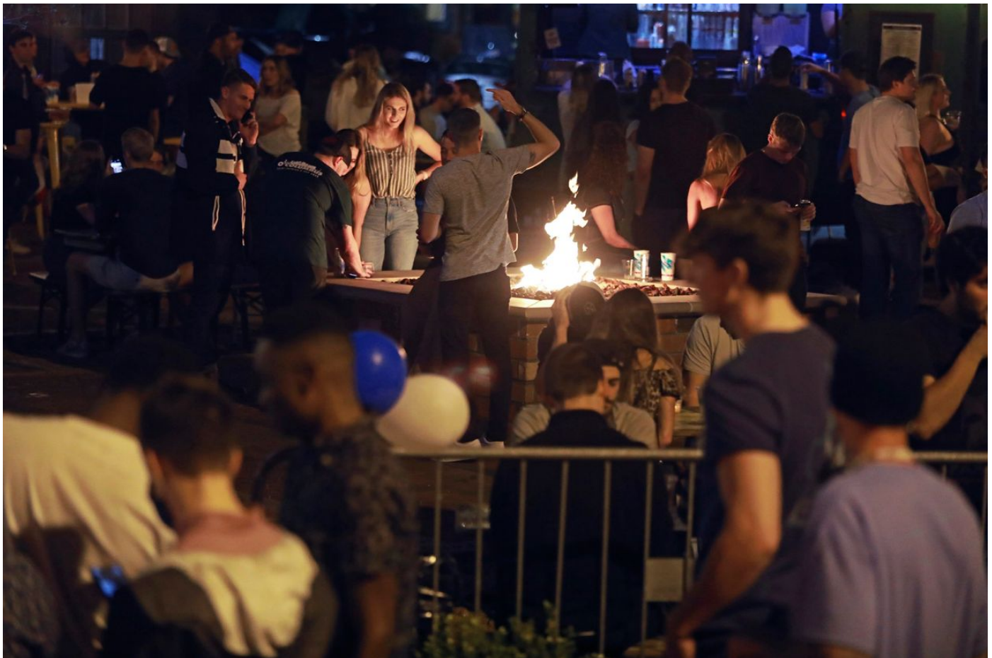
A crowd gathered at a bar in Columbus, Ohio, on May 15.

CDC guidelines for employers whose workers are returning include requiring masks, limiting use of public transit and elevators to reduce exposure, and prohibiting hugs, handshakes and fist-bumps. The agency also suggested replacing communal snacks, water coolers and coffee pots with prepacked, single-serve items, and erecting plastic partitions between desks closer than 6 feet apart.