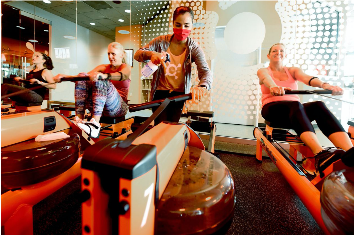
A gym in Chino Hills, Calif., on June 12.