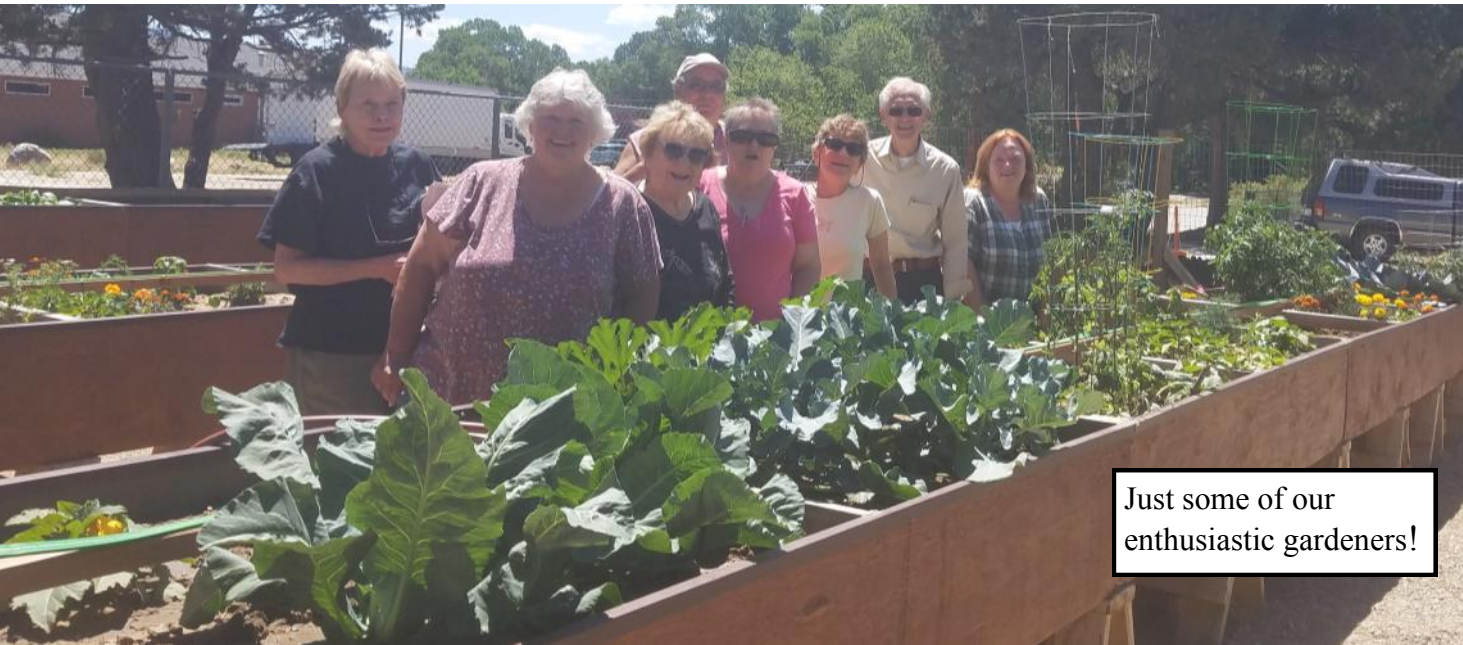
Just some of our enthusiastic gardeners!

In fact, one of the gardeners organized a meeting of the group to discuss whatever was on their mind in relation to the garden. Having them take ownership of this project was something unlooked for and yet highly gratifying.